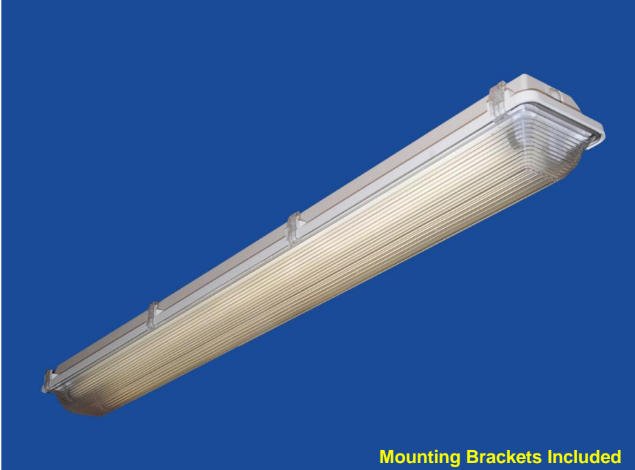
Mounting Brackets Included

Mounting: Vapor Tite Unit available with an stainless steel external hanging bracket. VT Series is watertight and must be drilled and sealed for each surface mounting or chain hanging application.