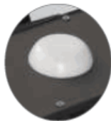
Microwave motion sensor