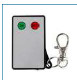
On / Off Remote Control