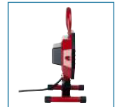
Up/ Down Tilting