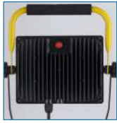
On / Off Switch