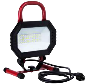
C Foldable Work Light