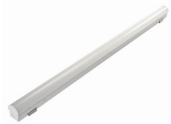
19W, 120-277V Input, 0-10V Dimming