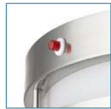
Emergency Battery Back up